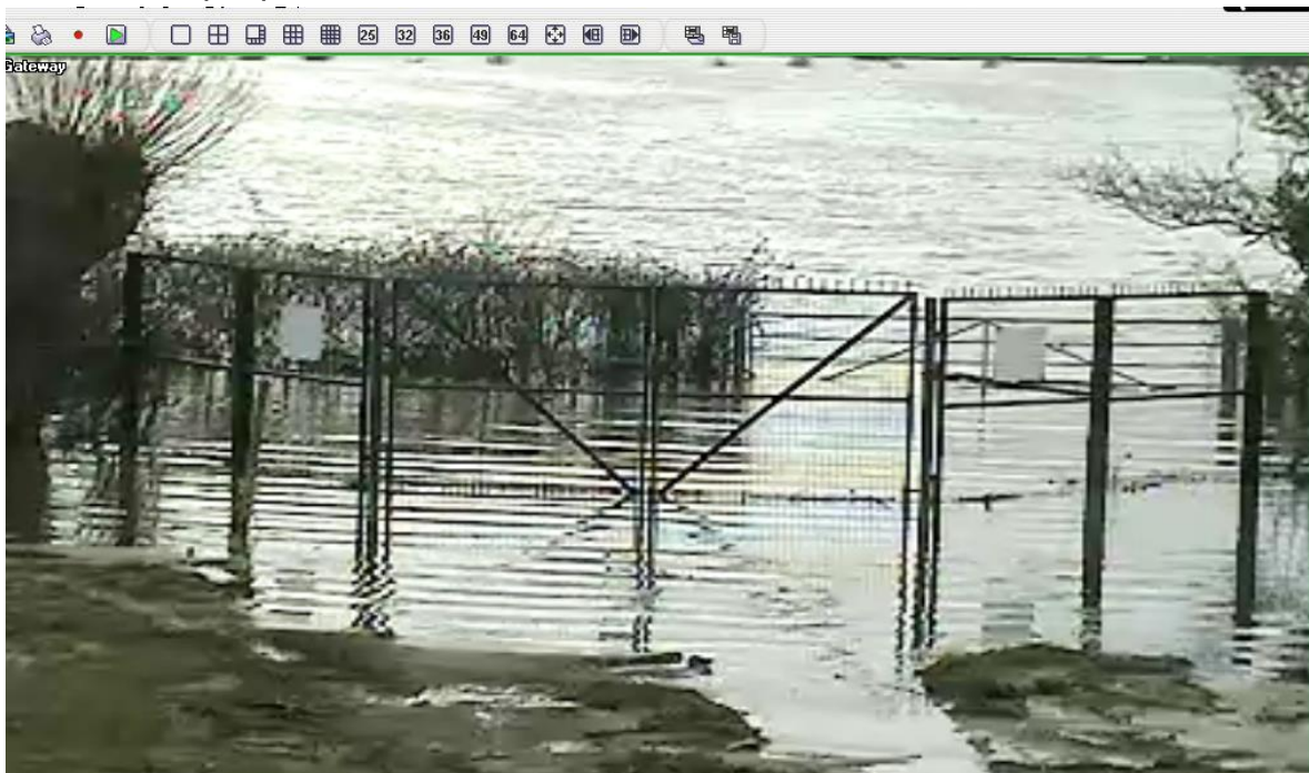
Long Sutton-08 January 2014

Example photo from remote Wi Fi Camera below:-